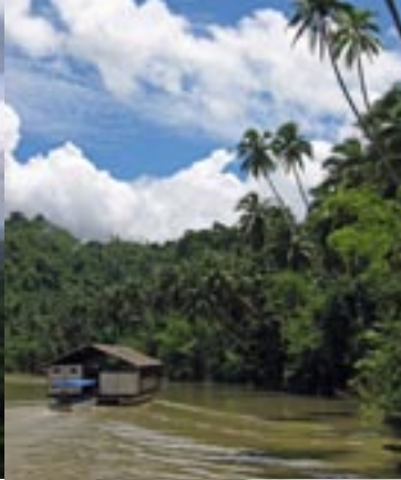
Loboc River Cruise ▲