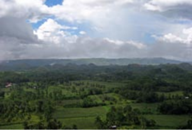
▲ Chocolate Hills