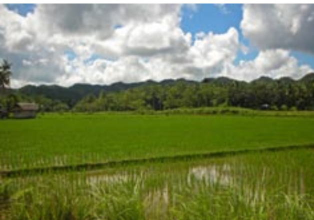
Bilar Mahogany Forest ▼