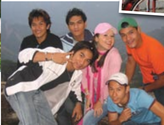
◀ The overlooking view of Mines Park View.