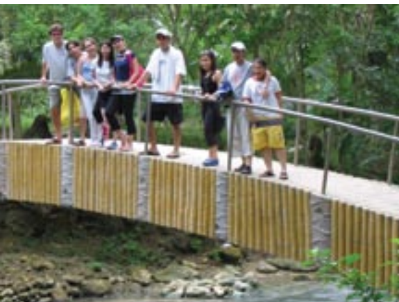
▲ Indulge your senses in the scenic beauty of the Burnham Park.