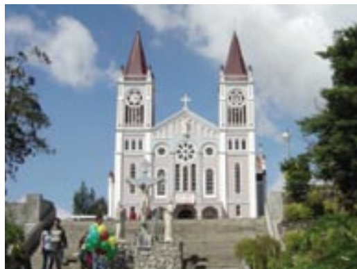
◀ The splendor of the Baguio Cathedral, one of Baguio's major landmarks.