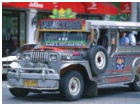
The Philippine Jeepney is the best way to get around Baguio City.

Baguio boasts of its wide array of locally made crafts and souvenirs for visitors hoping to score a shopping deal or two. Popular items are hand crafted accessories and beaded