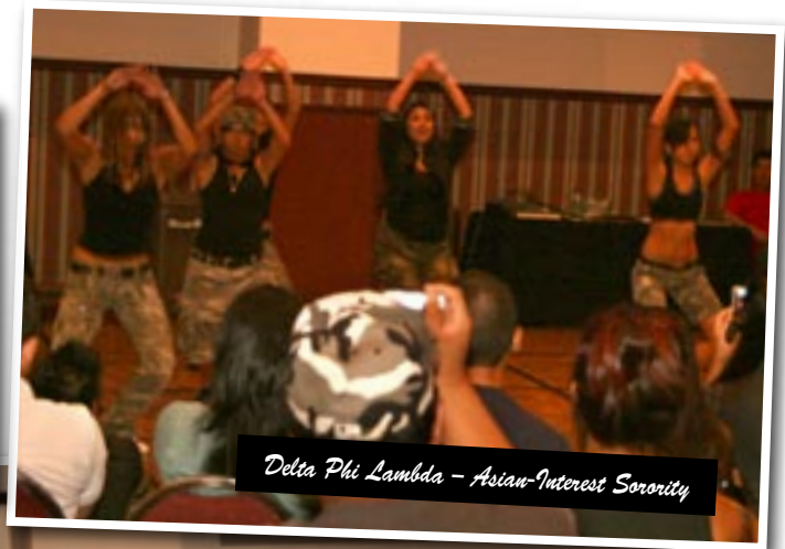
Delta Phi Lambda - Asian-Interest Sorority