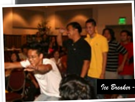
Ice Breaker - Japanese Algorithm Dance