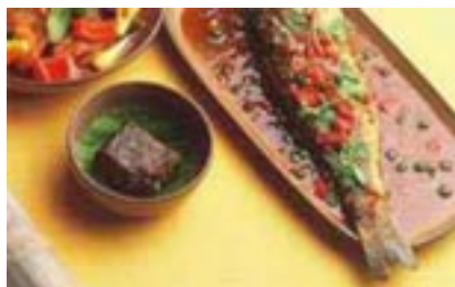
An exquisite dining experience at the Rainbow Garden restaurant