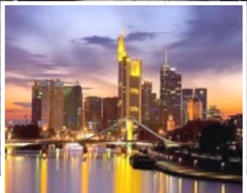
A stunning view of Frankfurt's skyline

F rankfurt — the largest financial centre on the continent, the historical city of coronations, and the city of Goethe and the Frankfurt School. In brief, it is the smallest metropolis in the world, in which there is a lot to discover close at hand.