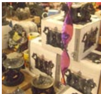
A plethora of Asian decors, teas and trinkets found in many malls and department stores throughout the city