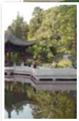
The beautiful Chinese gate into Bethmann Park