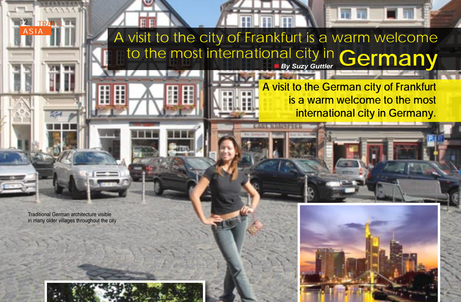
Traditional German architecture visible in many older villages throughout the city

A visit to the German city of Frankfurt is a warm welcome to the most international city in Germany.