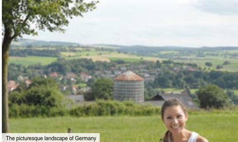
The picturesque landscape of Germany

Asian arts and crafts are popular items among Germans and Asian Germans alike. A stroll through a local mall or department store would offer the shopper the opportunities to view and purchase spectacular pieces from all over Asia to include fine teas, home décor, ornaments and Asian garments.