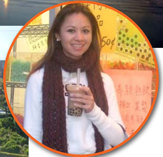
Enjoying a cup of bubble tea in Chinatown.