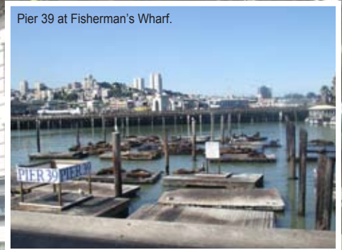
Pier 39 at Fisherman's Wharf.